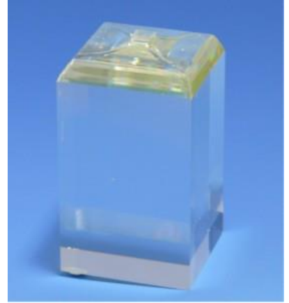
KTN Single Crystal